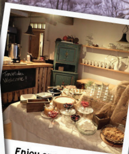
Enjoy organic food