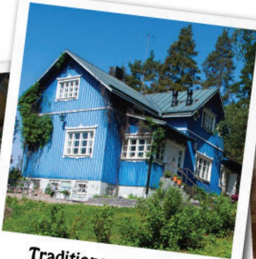
Traditions and culture