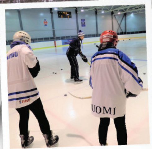
Learn ice hockey