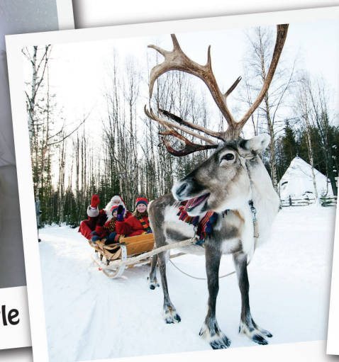
Rudolf the Rednose