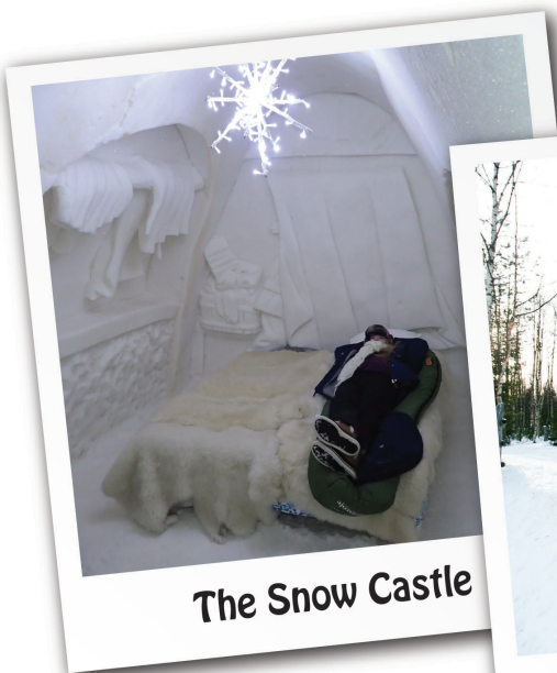
The Snow Castle

Email jaana.makela@uudenmaanseuramatkat.fi