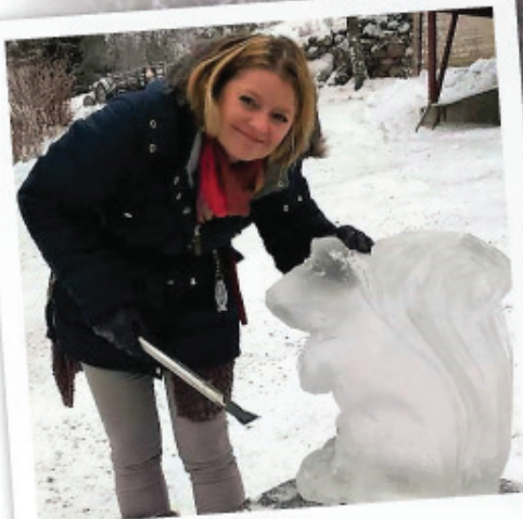
Become an ice sculptor